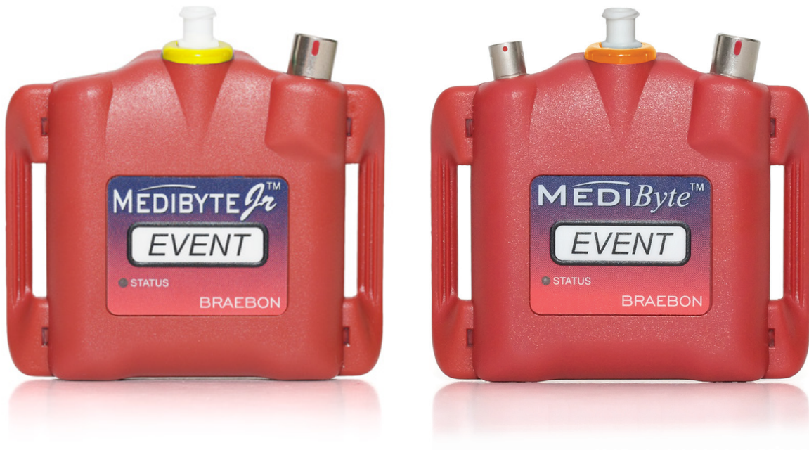
MediByte® Jr Type 3 • 7 Parameters